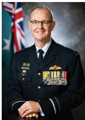
Air Vice-Marshal Warren McDonald, AM, CSC Deputy Chief of Air Force

This second edition of the Program of Work reflects changes flowing from the Defence White Paper 2016 and includes a dedicated project designed to deliver a modern education and training system within Air Force. It continues to describe the work necessary to transform Air Force into the force needed for 21st century operations. Air Force remains committed to delivering this program.