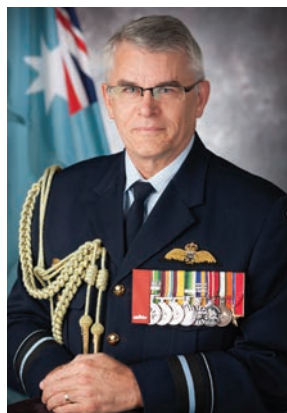
Air Vice-Marshal Gavin Turnbull, AM Air Commander Australia