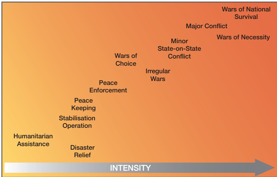
Figure 2. The Spectrum of Conflict.

employed—land or maritime—the air power roles remain enduring. In fact the only real difference that the Air Force has to cater for is the necessity to adjust the tactical training regime in a nuanced manner to cater for the environment.