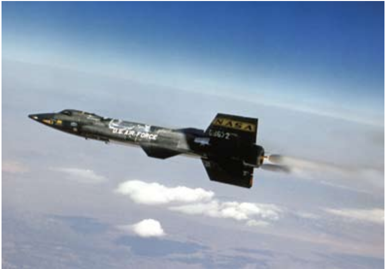
X-15 in flight