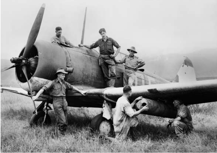
New Guinea, Jan 1944. Members of No 4 Squadron prepare a storepedo of Christmas comforts on an Australian Wirraway.