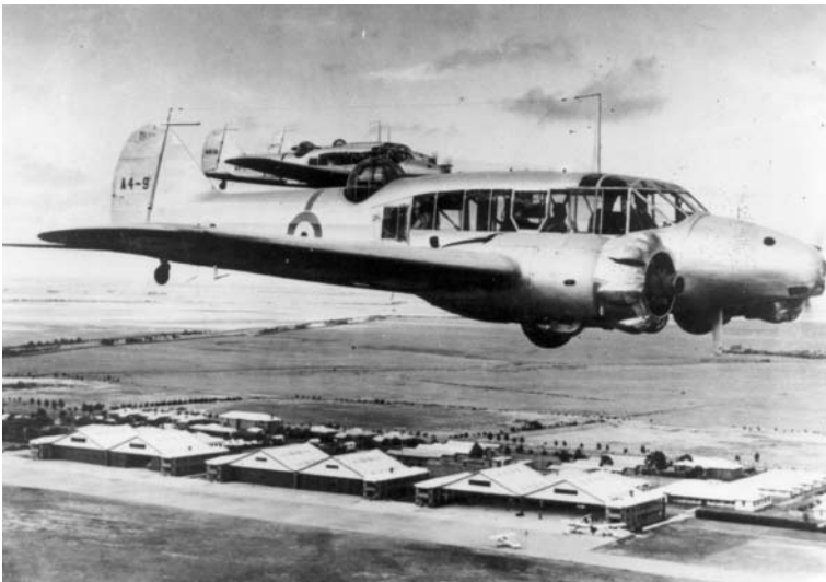
RAAF Ansons (type shown) flew in search of Sydney