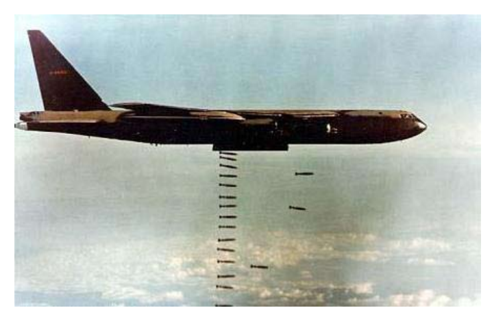
B-52D bombing North Vietnam during Operation Rolling Thunder

The aims of the campaign were to persuade the North to cease its support of insurgency in South Vietnam, to destroy North Vietnam's capacity to wage war, and to interdict the flow of men and material into the South. In November 1968 the operation was