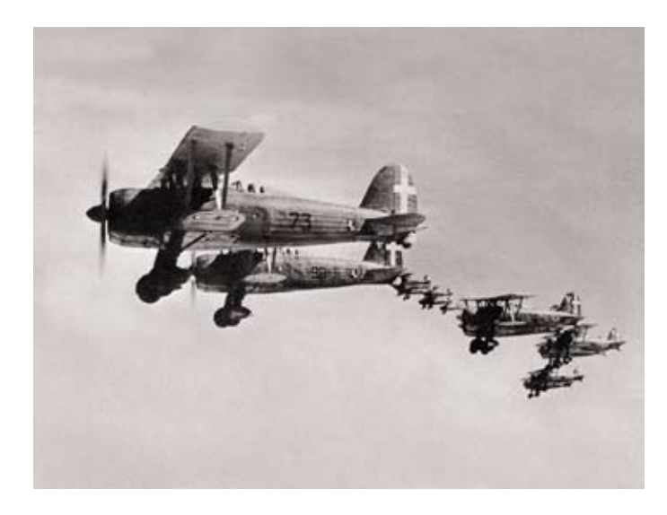
Italy's most numerous front-line fighter in 1940 - Fiat CR.42

When called upon to advance Italy's long-held ambition of carving out a new Roman Empire in the Mediterranean, the Regia Aeronautica 's doctrinal and operational vacuum meant it was simply not up to the task.