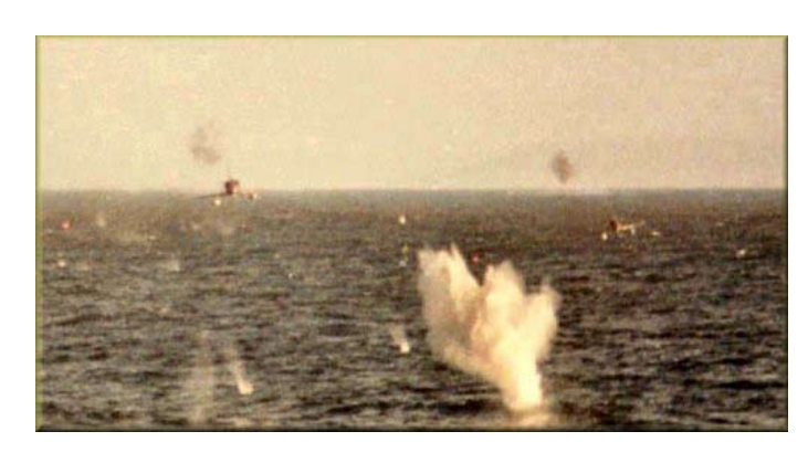
Argentine Skyhawks attack HMS Broadsword

When Argentina seized the Falkland Islands in April 1982, the Argentinean air forces—the Air Force (Fuerra Aerea Argentina or FAA) and the naval air arm (Comando de Aviación Naval Argentina or COAN)—were the largest and the best trained and equipped in South America. Argentina, however, had never seriously considered the possibility a war against a sophisticated major NATO power such as Great Britain. The British Government's decision and determination to retake control of the islands by force caught Argentina's ruling military junta by surprise. The FAA was not trained or equipped for a long-range naval air campaign. Although the FAA and the COAN possessed some relatively modern combat aircraft and small number of sophisticated Exocet anti-ship missiles, the majority of its attack